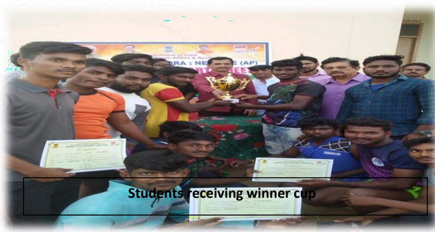
Students receiving winner cup

B. & PRINCIPAL PRR & VS GOVT. COLLEGE VIDAVALUR - 524318. SPSR NELLORE DT.