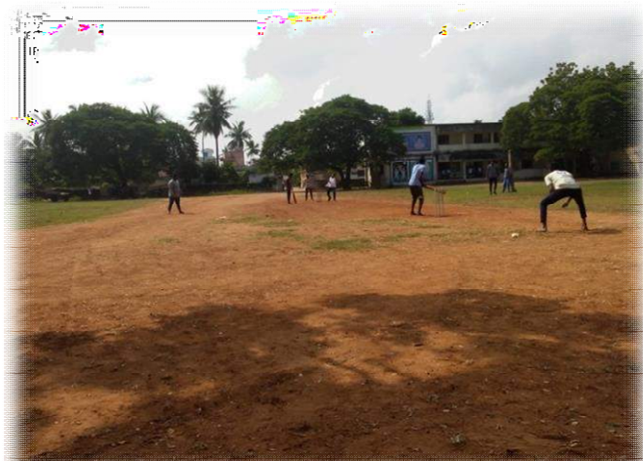
CRICKET TOURNAMENT BETWEEN III & II YEARSTUDENTS