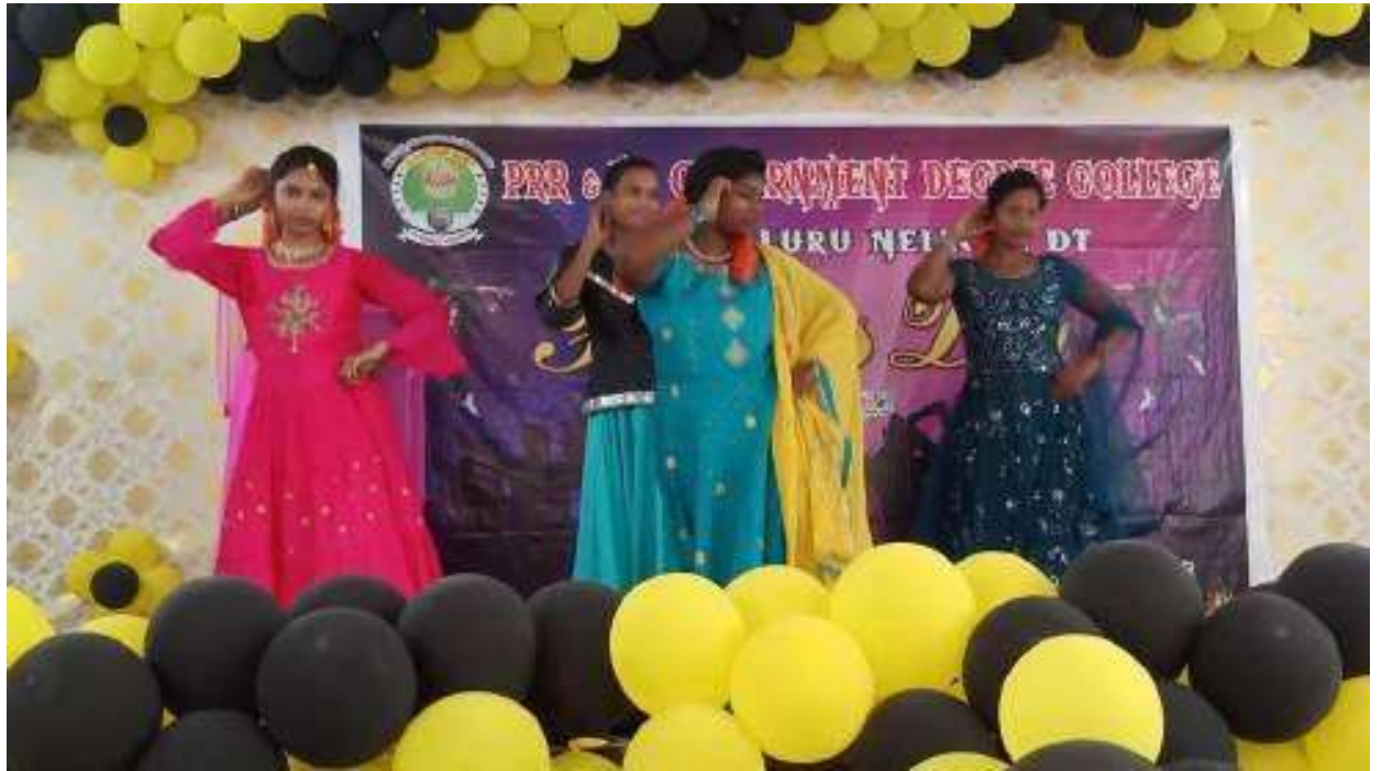
Gallery-1: Students (Boys & Girls) Participated College level Cultural Programmes