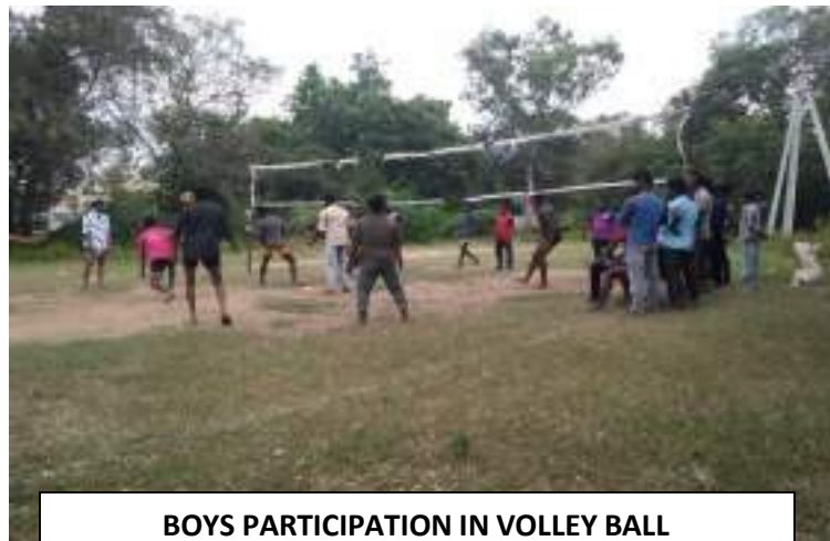
BOYS PARTICIPATION IN VOLLEY BALL

B. & - PRINCIPAL PRR & VS GOVT. COLLEGE VIDAVALUR - 524318. SPSR NELLORE DT.