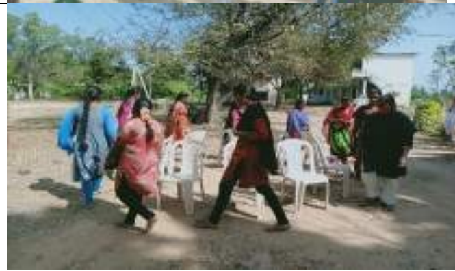
Gallery-1: Students (Girls) Participated College level sports and Games