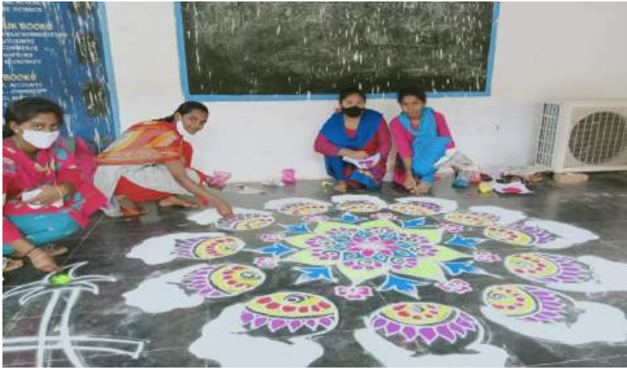
Gallery-1: Students (Boys & Girls) Participated College level Cultural Programmes