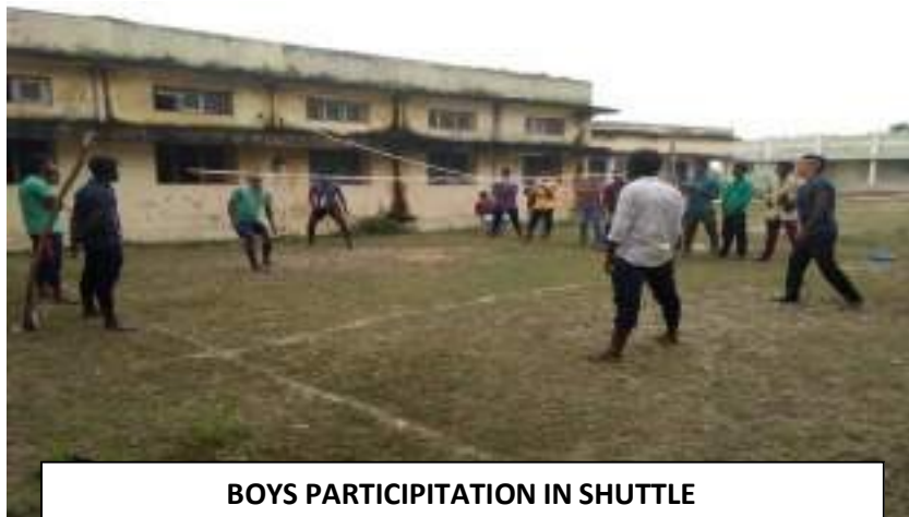
BOYS PARTICIPATION IN SHUTTLE